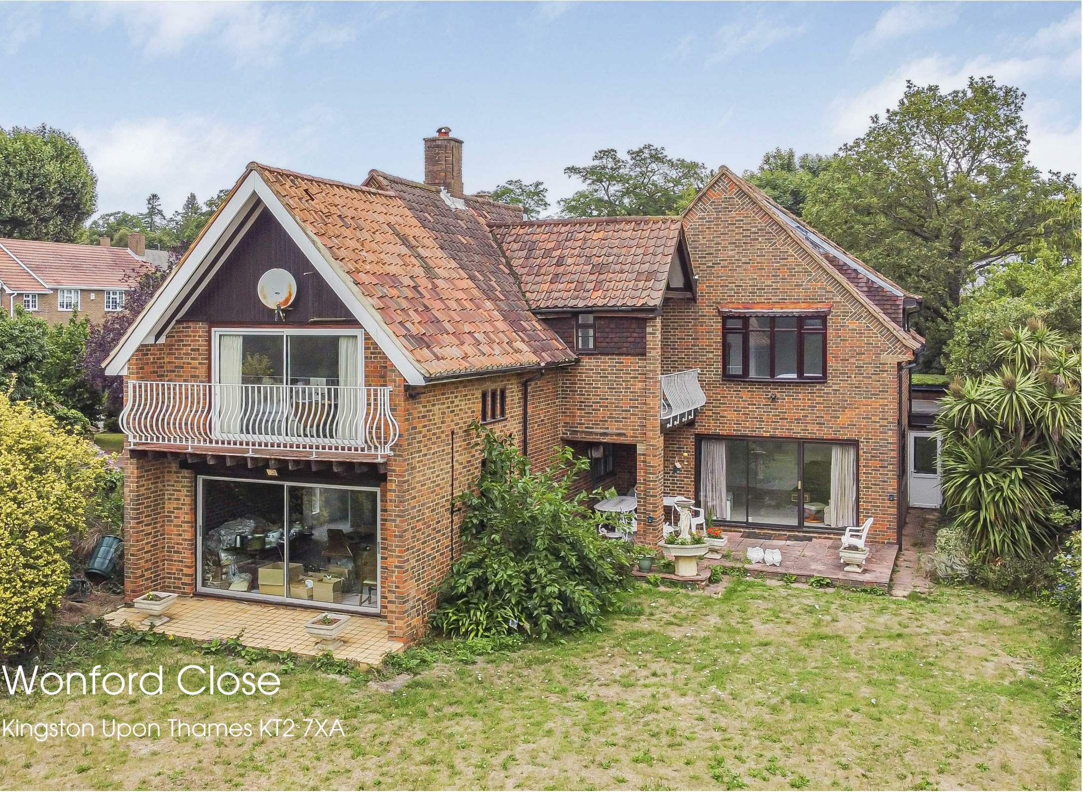
Wonford Close Kingston Upon Thames KT2 7XA

Approximate Gross Internal Area 2739 sq ft - 254 sq m (Including Garage) Ground Floor Area 1149 sq ft – 107 sq m First Floor Area 1124 sq ft – 104 sq m Garage Area 466 sq ft – 43 sq m